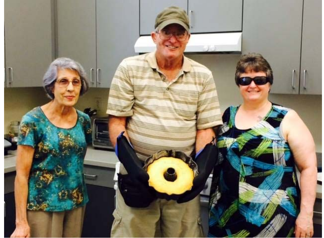
These students in Winter Haven baked a bundt cake to demonstrate kitchen skills they learned to their family members.

In many respects, our Independent Living classes represent the cornerstone of services we offer to help those with visual impairments lead normal lives. Those who gain or regain their independence in day-to-day activities often pursue other