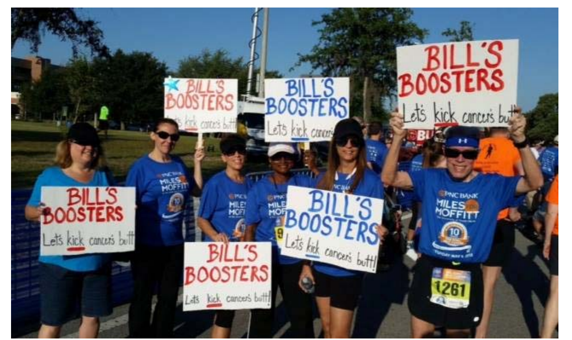
The Lighthouse's Bill's Boosters team came out to Miles for Moffitt to march, display our signs, and support the fight against cancer.

The Lighthouse is not content just to receive community support - students and employees alike find ways to serve the community outside the Lighthouse walls. It's simply called "giving back" and it is well-ingrained in the Lighthouse culture.