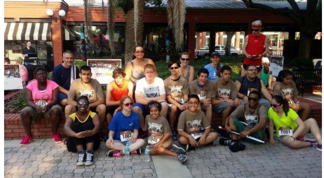
Transition students and teachers from both Tampa and Winter Haven came out to support and participate in Race for Sight.